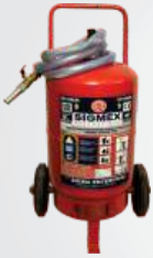
ABC 25 kg Cartridge