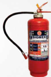
DCP 9 kg Cartridge