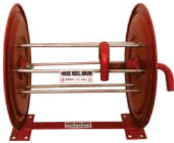
Hose Reel 30 Mtr.