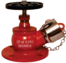
Hydrant Valve Single