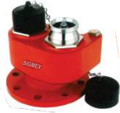
2 Way Inlet