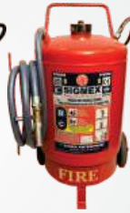
DCP 50 kg CO 2 , Outside