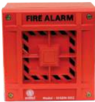
ABS / MS Hooter