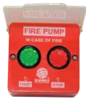
ON - OFF