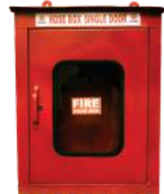
Hose Box Single Door