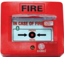
ABS / MS MCB