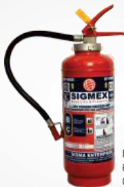
DCP 6 kg Cartridge