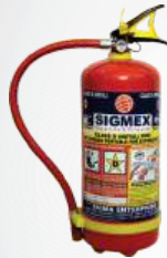
4 kg Stored Pressure Type