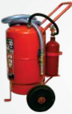
DCP 25 kg CO 2 , Outside