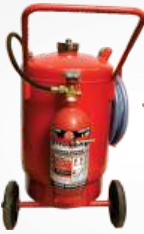
DCP 50 kg CO Outside Back