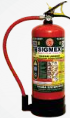
4 kg Bottom Stored Pressure Type