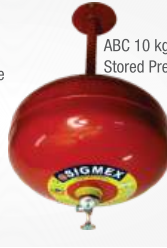
ABC 10 kg Modular Stored Pressure Type