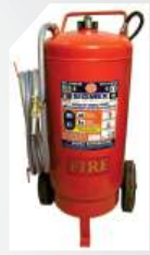
DCP 75 kg CO 2 , Outside