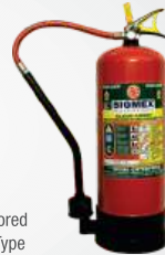
9 kg Bottom Stored Pressure Type