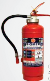
DCP 4 kg Cartridge