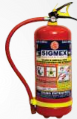
6 kg Stored Pressure Type