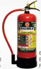
6 kg Bottom Stored Pressure Type