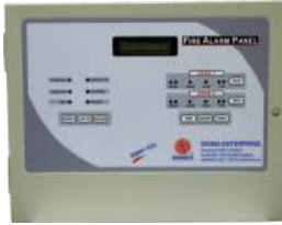
Fire Alarm Panel