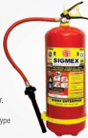
Mechanical Foam 9 Ltr. Stored Pressure Type