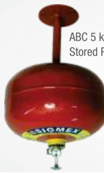
ABC 5 kg Modular Stored Pressure Type