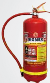
Water 9 Ltr. Stored Pressure Type