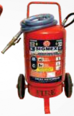
DCP 25 kg Cartridge